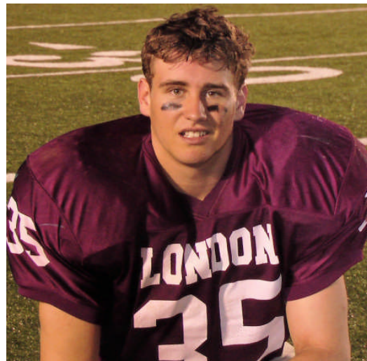
London Falcon and South Football Athlete